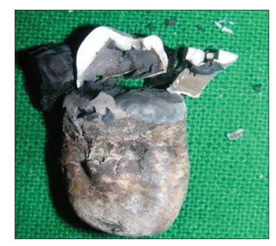
Figure 5: Zinc oxide eugenol at 600: macroscopically dark gray with cracks and dimensional contraction by loss of water, agglomerated particles of zinc