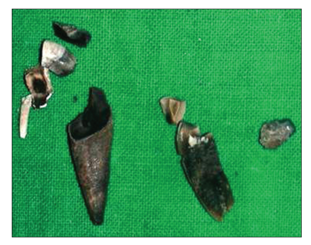
Figure 2: Unrestored tooth at 600°C: macroscopic evaluation showed black discoloration of the whole tooth, a shattered part of the crown and detachment of the enamel

According to the Gustafson, no major changes are observed in teeth and fillings below 200°C. Hence, the study commenced at a temperature of 200°C and above. The greatest disparity in the effect of high temperatures on restorations is seen in amalgam fillings.<sup>[6]</sup> Pink pigments due to Copper oxides and a golden thread due to mercuric oxide vapors that were seen in other studies were absent in this study.<sup>[6]</sup> The difference in the composition of amalgam and an inconsistency in the percentages of mercury, silver, and copper found in amalgam available in different parts of the world may be responsible for this discrepancy.<sup>[5]</sup> Some fillings of Amalgam have been reported to resist temperatures as high as 870°C.<sup>[2]</sup> The contraction of the restoration and loss of marginal seal was due to