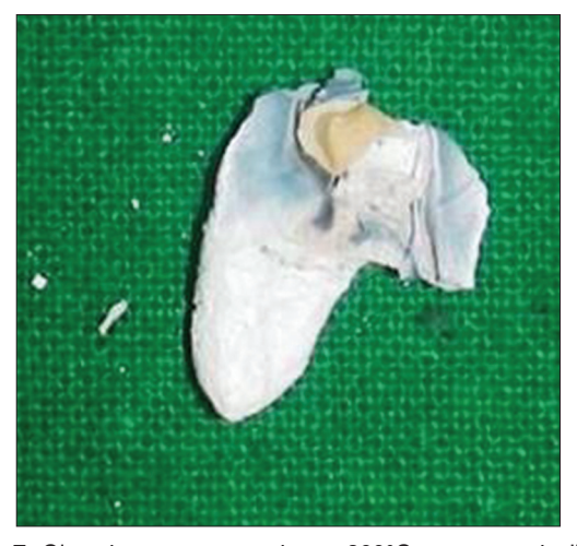
Figure 7: Glass ionomer restoration at 800°C: macroscopically only a portion of the crown structure along with the filling remained. The filling remained intact within the crown which had turned opaque white as had the root

evaporation of mercury and loss of organic matrix.<sup>[6]</sup> The bubbles observed on the surface of the restoration were due to evaporation of mercury.<sup>[6]</sup> Gold Inlays are known to resemble amalgam fillings because of the deposited vapor of mercury on it.<sup>[2]</sup>