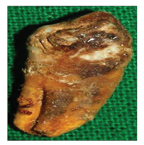
Figure 1: Unrestored tooth at 200°C: Macroscopically evident change of color, tending to yellow, brown, of both the root and the crown

Most of the microscopic studies of enamel showed structural changes at 800°C, whereas dentin showed changes at a comparatively lower temperature of 600°C.<sup>[1]</sup> These changes are the result of the physiochemical properties of the material and their nature. Even with these changes, individual components like amalgam residues are identifiable even at temperatures more than 1000°C.<sup>[4]</sup> The change in the color, hue of the restoration and their external appearance are the most commonly observed findings in an incinerated tooth.<sup>[2,5]</sup> Teeth are amazingly resistant to heat if it is subjected to it gradually, but if heated severely the tooth may disintegrate; else they may resist temperatures unto 1200°C.<sup>[6]</sup> Care must be