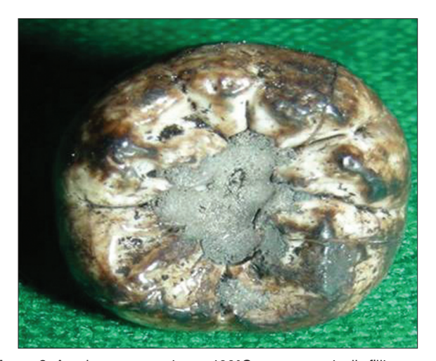
Figure 3: Amalgam restoration at 400°C: macroscopically fillings were in place, although both showed the same phenomenon noted at 200°C, that is the presence of bubbles on the surface