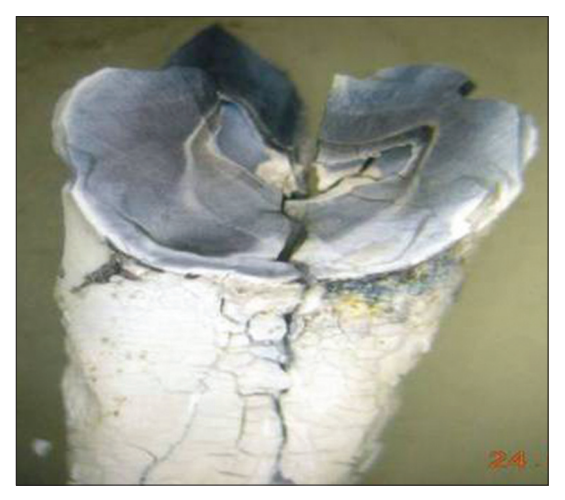
Figure 6: Glass ionomer restoration at 600°C: Stereomicroscope showed deep fracture lines along the length

The charred appearance of the tooth indicates sudden and quick carbonization of the tooth and its conversion into solid carbon as any biomaterial does on exposure to high temperatures.<sup>[2]</sup> The teeth used in this study were specifically restored post extraction; hence, the time elapsed since the fillings were carried out and the teeth incinerated