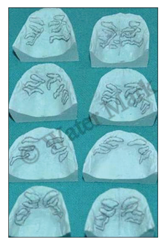
Figure 7: Example for watermarking an image

like.) It's like a miniature text file appended to files only adding a few bytes to the total file size so as to discourage manipulation at an amateurish scale.<sup>[10,11]</sup> Most of the images are stored in Exchangeable Image File (EXIF) format, so that you can view it in any organizer that can speak EXIF format.<sup>[19]</sup>