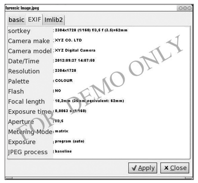
Figure 6: Example for image metadata

It is attaching of information in the form of data to digital image. (Figure 6 shows how an image metadata looks