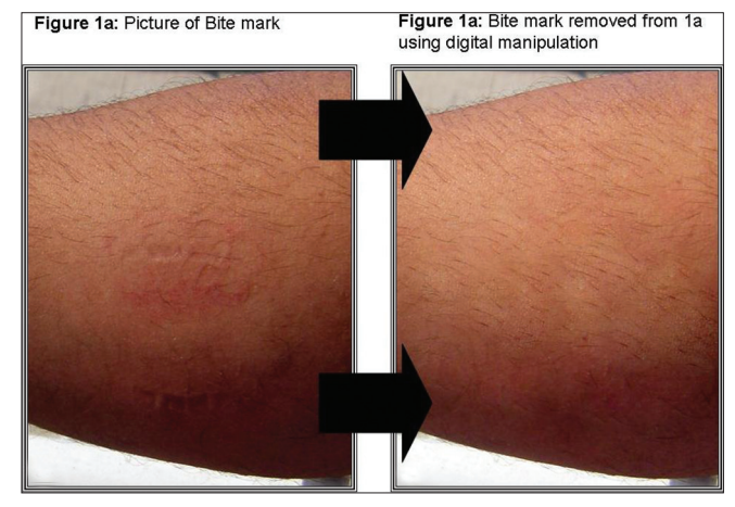
Figure 1: Usage of merge tool on a bite mark photograph