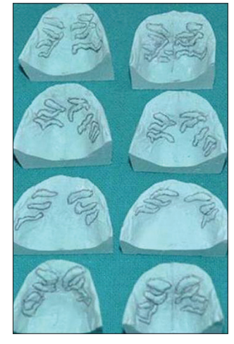
Figure 4: Digital photographic records of palatal rugae on casts

Procedural hindrances to objectionable image manipulation have been greatly reduced resulting in an ease of bringing about any change to an image with just the click of a mouse. Over the last 10-15 years, there have been a few highly public instances of falsified images (Abbott 1997;<sup>[9]</sup> Aldhous and Reich 2009;<sup>[10]</sup> Weissmann 2006;<sup>[11]</sup> Xin 2006;<sup>[12]</sup> Young 2008<sup>[13]</sup>), but most of the problem lies with the lack of a basic understanding of how to properly handle image data.<sup>[14]</sup> Digital image modification is done at a pixel level and makes it to a large extent undetectable when viewed with a naked eye. Several measures, such as few described below, help in detection of altered digital images: