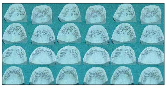
Figure 5: Modification of Figure 4 showing how the same data was multiplied

deviations of the underlying color filter array correlations. A digital composite of two people can be detected by measuring differences in the direction to the illuminating light sources from their faces and body. Any inconsistencies in lighting can then be used as an evidence of tampering. Duplication or cloning can be detected by first partitioning an image into small blocks. The presence of identical and spatially coherent regions in an image can be used as an evidence of tampering.<sup>[16]</sup>