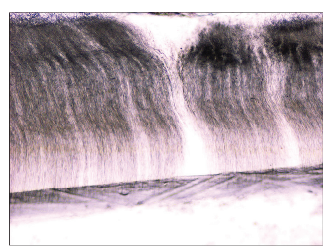
Figure 3: Ground section of teeth showing dentin