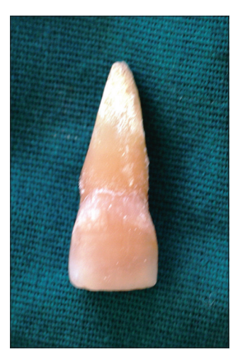
Figure 1: Pink appearance along the cervical region of the tooth

The ground section revealed red-brown discoloration of the dentin [Figures 3 and 4], whereas, the hematoxylin and eosin (H and E)-stained section does not show any notable changes [Figure 5].