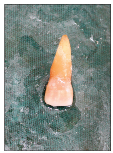
Figure 2: Pink appearance along the cervical region of the tooth

Postmortem pink teeth phenomenon is a condition that may be noted among deceased individuals due to the development of intrapulpal pressure. Various factors including physical trauma and a moist environment play a major role in the development of the pink appearance.[14,16-18] In forensic literature, authors who reported cases of pink teeth, note the time delay between death and development of pink appearance. [16,18] They attribute the cause of discoloration to red blood cells entering the dentin.[18] However, as red blood cells are 7.5 microns in diameter and dentinal tubules are only 3 micrometers in diameter, it is the lysis of erythrocytes and the products of erythrocytes like hemoglobin, porphyrins, and hemosiderins, together with bile and related pigments that are responsible for the pink appearance. The literature mentions the variation in the intensity among different teeth and also the regions of the teeth. The appearance of pink teeth can be noted among incisors, canines, and premolars. Within the