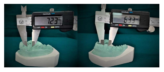
Figure 2. Measuring of mesiodistal dimension of permanent maxillary Canine.