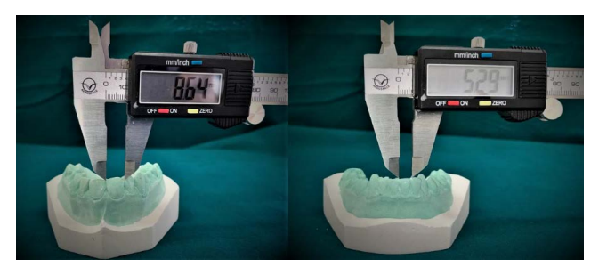
Figure 1. Measuring of mesiodistal dimension of permanent maxillary central incisor.

In Table 3, the mean of intermolar width in the maxillary arch was mentioned along with the standard deviation. The mean of the IMW of maxillary arch in boys