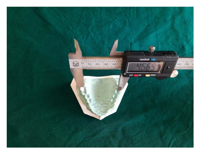
Figure 3. Measurement of permanent maxillary intermolar width.